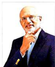
CHAIRMAN THE ASSOCIATION OF BANKS IN SINGAPORE (ABS)