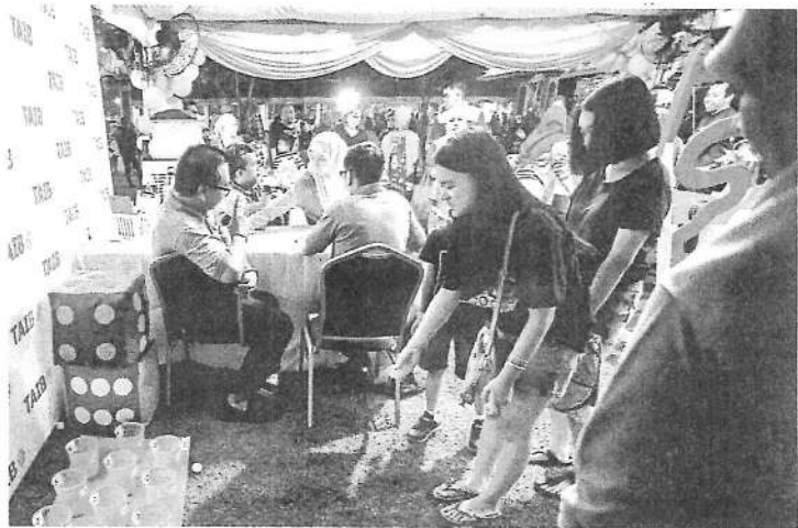
Photos show visitors at the Perbadanan Tabung Amanah Islam Brunei booth.