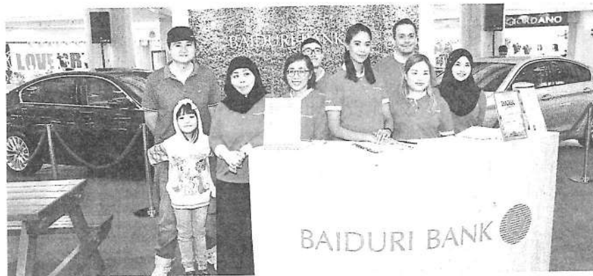
Participants of the Baiduri Community Park roadshow with bank staff.

A range of activities specially selected to be enjoyed with friends and family like Nintendo Switch™ games and a music/rhythm game, a kid's corner and quizzes where participants can win shopping