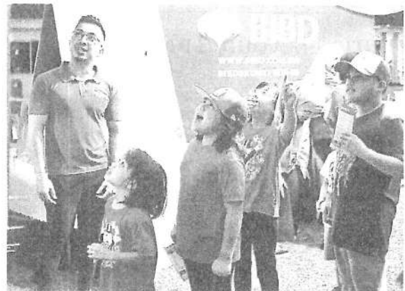
BIBD staff attend to guests at the fair