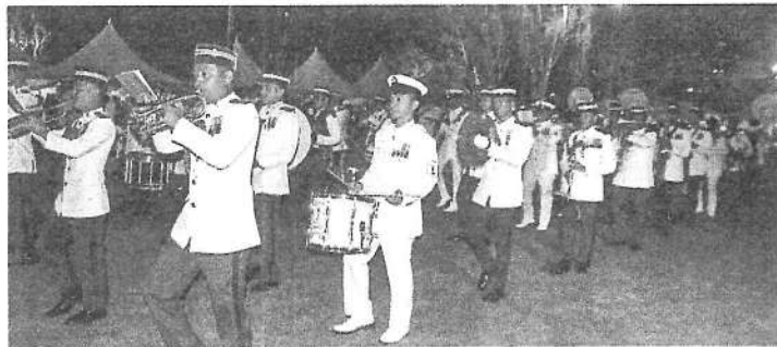
The tattoo performance by the Royal Brunei Armed Forces (RBAF) personnel

The 4 th Financial Fun Fair will continue on today. Tickets to the Financial Fun Fair can be purchased from the AMBD Ticketing Booth at Jerudong Park Playground.